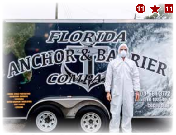
Insulation & Vapor Barrier Repairs Soft Floor Repairs & Laminate Flooring

Wishing you good health and safety, The Florida Anchor & Barrier Team